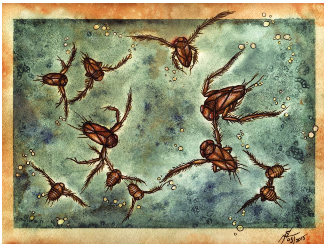
“Vast numbers of Corixidae were living in the water”—G. E. Hutchinson ( The American Naturalist, 1959, 93:145–159).